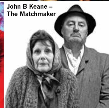
John B Keane – The Matchmaker