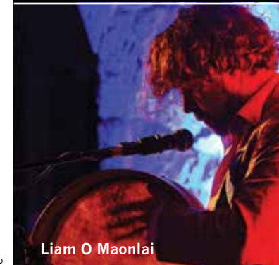
Liam O Maonlai