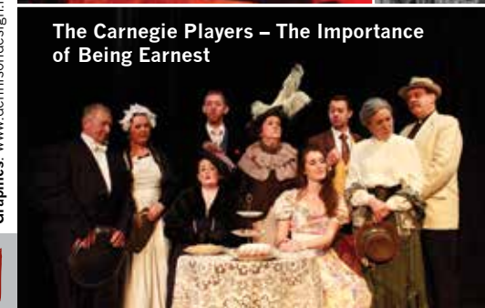
The Carnegie Players – The Importance of Being Earnest